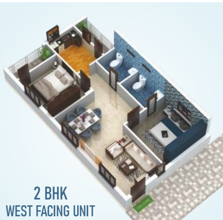
2 BHK WEST FACING UNIT