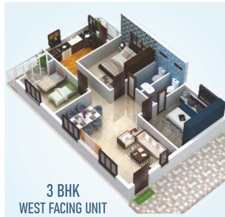
3 BHK WEST FACING UNIT